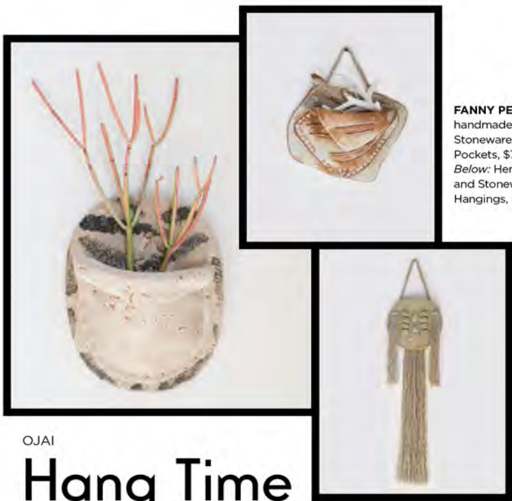
FANNY PENNY handmade Stoneware Wall Pockets, $75-$275. Below: Hemp Rope and Stoneware Wall Hangings, $125-$695.