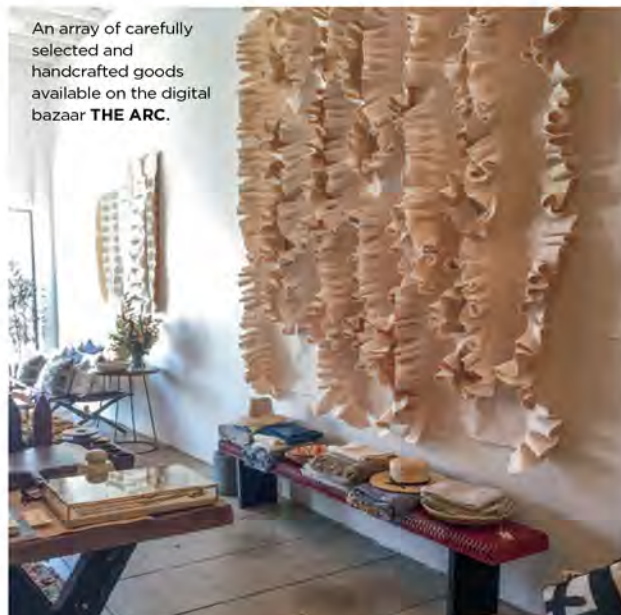
An array of carefully selected and handcrafted goods available on the digital bazaar THE ARC .